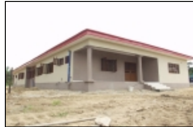
Left Third Clinic, Bayelsa State