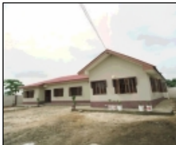
Right Sir Cliff Richard Second Clinic Riverstate