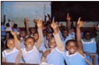
Above; Children of Nkambe School, Kumbo Diocese, Cameroon

The charity is also planning with The UNITE Group PLC, the first SFA’s National Keep-Uppie Challenge in July 2007