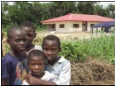
Left: Children at third clinic