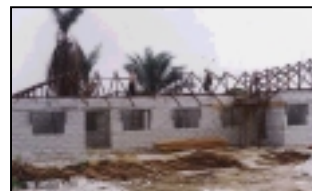
Left Step 1 Second Clinic, Rivers State

There will be a Reception, hosted by The Rt Hon Lord Janner of Braunstone on the 20 th of April 2006 at the House of Lords to launch the Cameroon project. Guests will include the Arsenal Football player Lauren who is supporting the project.