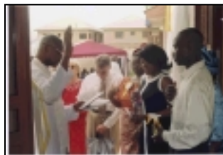
Right: Blessing of Clinic