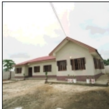
Right Sir Cliff Richard Second Clinic Riverstate