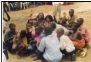
Left: Children at second clinic