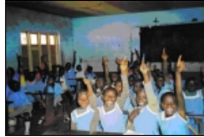
Above: Children of Nkambe School, Kumbo Diocese, Cameroon

We hope to complete this project before the end of 2006 in order to deliver much-needed healthcare to the local people of Tadu. St. Joseph's parish has had a long association with the Diocese of Kumbo in Cameroon, providing educational funds for orphans and vulnerable children in Kumbo.