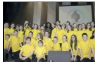
Right Scotland Reaching out for Africa 2004