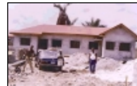
Right Step 2 Second Clinic, Riverstate

Richard Branson's Virgin Airlines sponsored our flights, and Novotel Hotel in Portharcourt sponsored our accommodation.